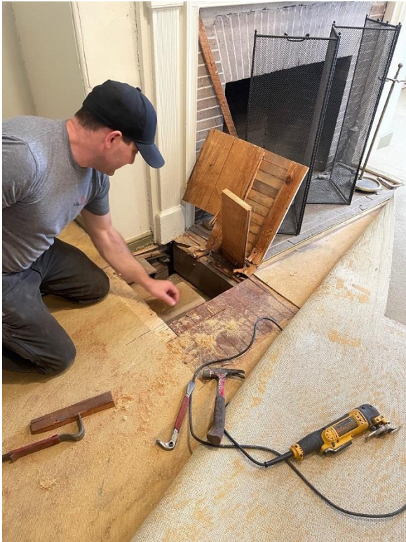
Removal of flooring in southwest parlor to investigate the condition of the fireplace supports.