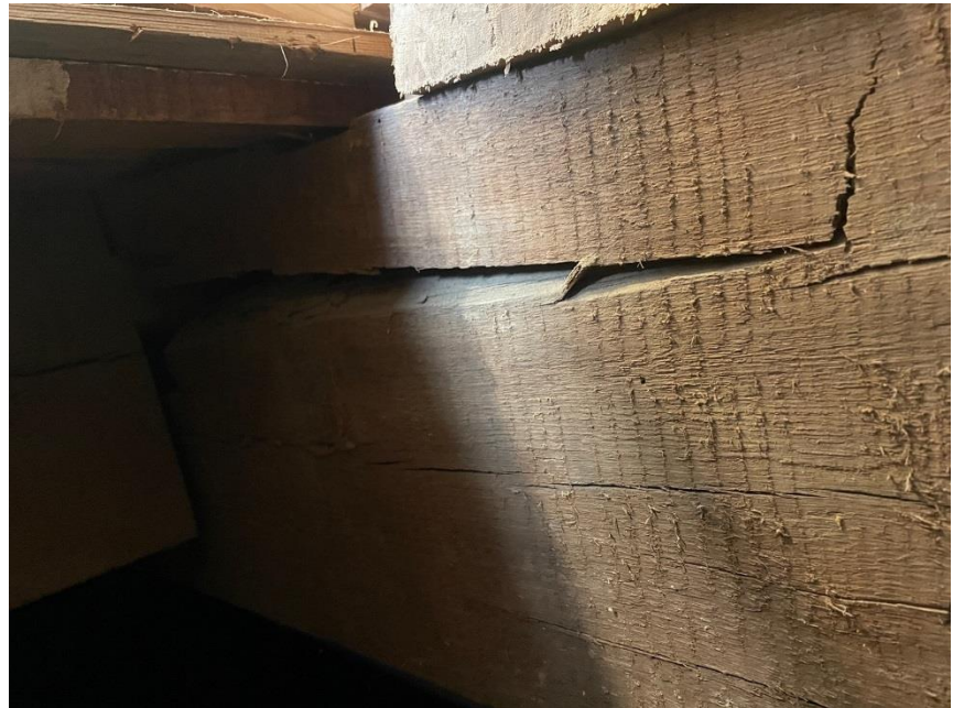
View the cracked fireplace header, which supports three levels of brick masonry.