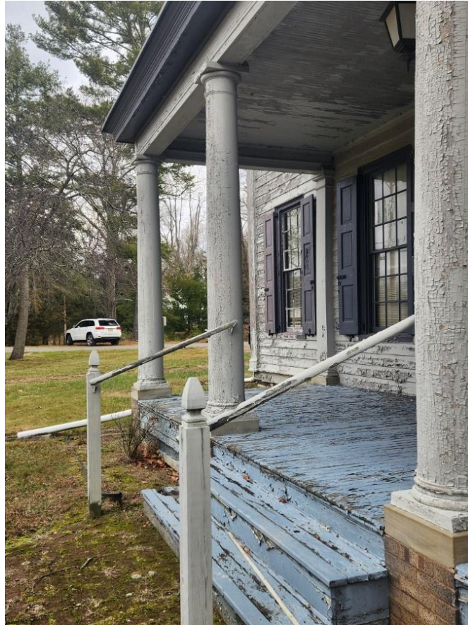
View of the front porch showing wholesale paint loss, which is throughout the painted porch elements.