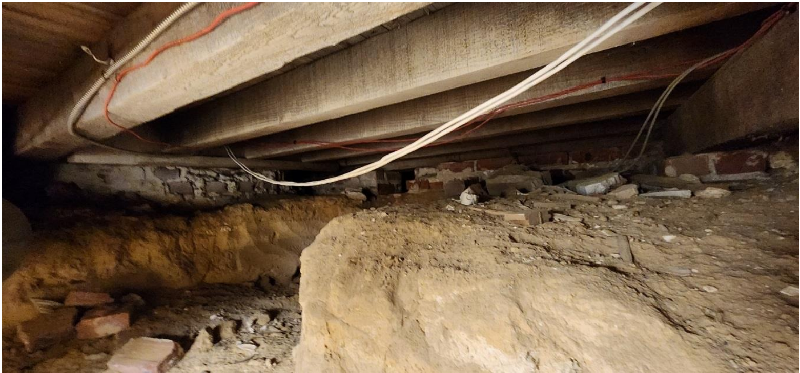
View of the crawlspace looking northeast showing how portions of the crawlspace have been dug out.